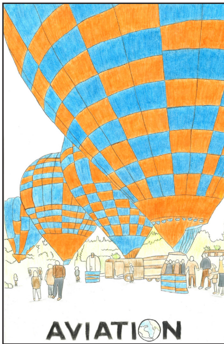
Daniela Naranjo, First Place, Intermediate (Ages 10-13), Knickrehm Elementary, Grand Island