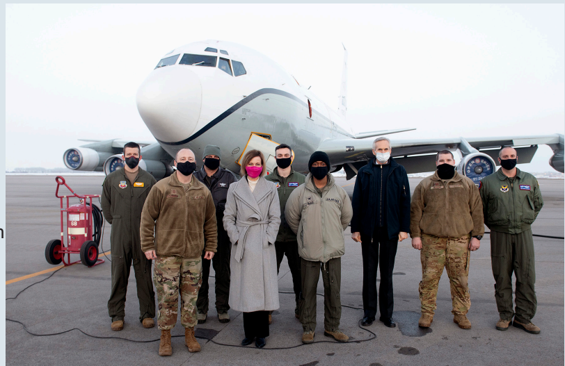
Aircrew members and 55th Wing leadership pose for a photo with civic leaders from Lincoln, Nebraska after the first 55th Wing aircraft arrives at the Lincoln, Nebraska Airport February 1, 2021. All 55th Wing aircraft will move from Offutt Air Force Base, Nebraska to the Lincoln Airport where they will temporarily operate out of during the replacement of Offutt's flight line, which is expected to be completed in 2022.

"This is much larger in scale as it is a full replacement," Michaud said, "and we will be here a lot longer this time." ■