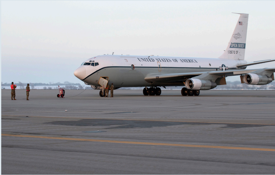
Aircraft maintainers from the 55th Aircraft Maintenance Squadron recover an OC-135B Open Skies at the Lincoln, Nebraska Airport February 1, 2021. All 55th Wing aircraft will temporarily operate from the Lincoln Airport during the replacement of Offutt's flight line, which is expected to be completed in 2022.

55th Wing Public Affairs, Offutt Air Force Base, Nebraska