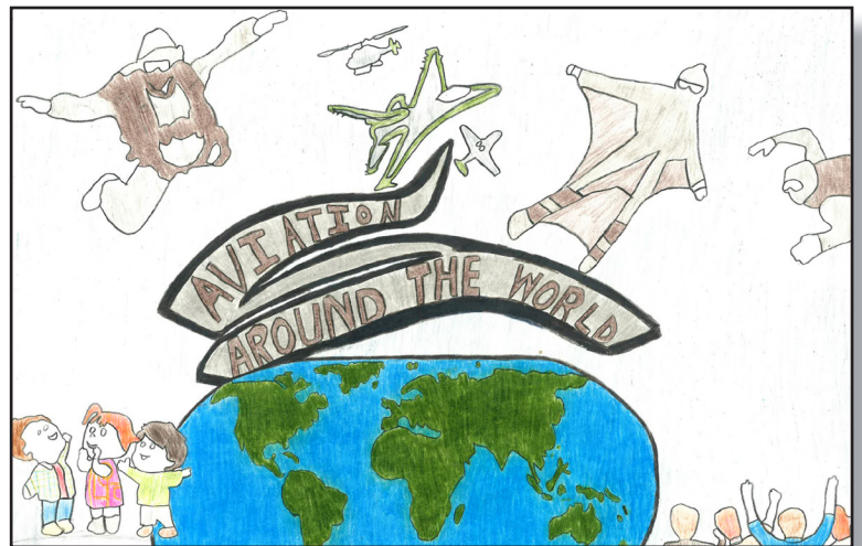
Abigail Rempe, Second Place, Intermediate (Ages 10-13) Knickrehm Elementary, Grand Island